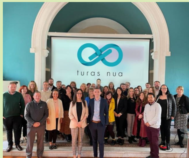
Above: Turas Nua team come together for service training.

In August, Turas Nua was awarded with ISO certification, owing to the high-level, quality service it provides. Along with this and our new Intreo Partner NES contract, staff have undergone various training throughout the year, and are well positioned to tackle 2023 and beyond!