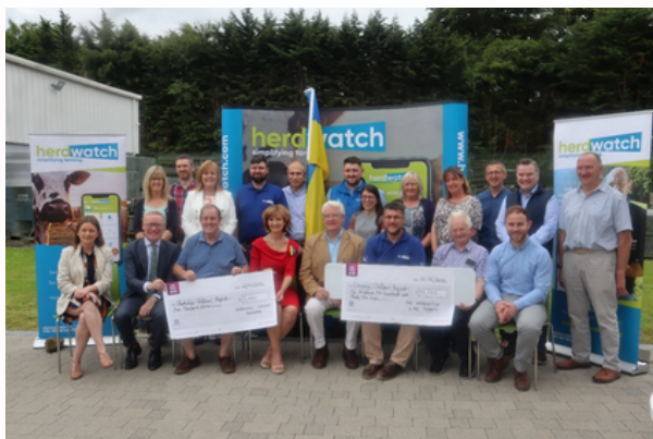
Above: Herdwatch donation to Chernobyl Children International who are supporting people in Ukraine.